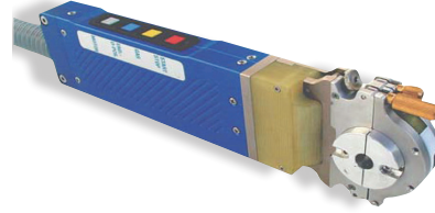
ORBIWELD 12 with wide clamping cartridge (Type "B")