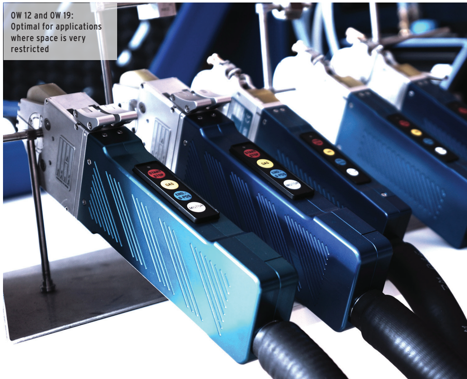
OW 12 and OW 19: Optimal for applications where space is very restricted

The small dimensions of the OW 12 and OW 19 weld heads make it ideal for applications where space is very restricted, such as the semiconductor industry, aerospace, pharmaceutical industry as well as the ultra pure water supply sectors. Particularly suitable for welding all common microfittings.