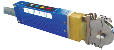
ORBIWELD 12 with narrow clamping cartridge (Type "A")