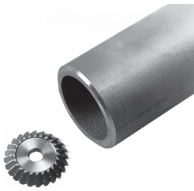
Bevel cutter V-prep