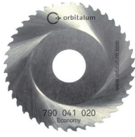
Saw blade Economy