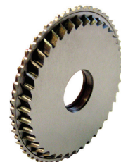
Press fitting saw blade/bevel cutter combination