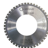
Saw blade Cermet