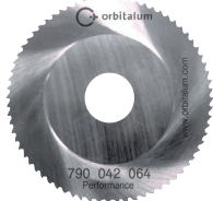
Saw blade Performance