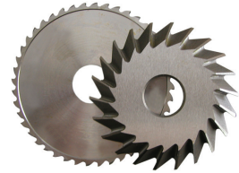
Weld-prep saw blade/bevel cutter combination (V-prep)