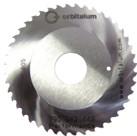
Saw blades with additional borehole