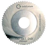
Saw blade Premium