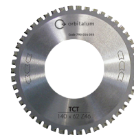
Saw blade TCT