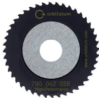
Saw blade High-Performance