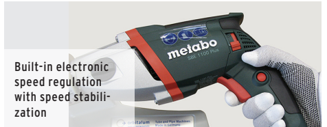
Built-in electronic speed regulation with speed stabilization