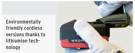
Environmentally friendly cordless versions thanks to lithiumion technology

Pipe and installation manufacturers from the high-purity gas, electronics, pharmaceuticals, food processing, beverages, solar and chemical industries benefit from the mobile, high-quality and burr-free processing of pipe ends.